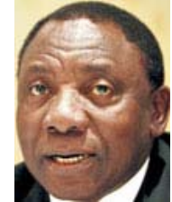
Cyril Ramaphosa - Hanging in there